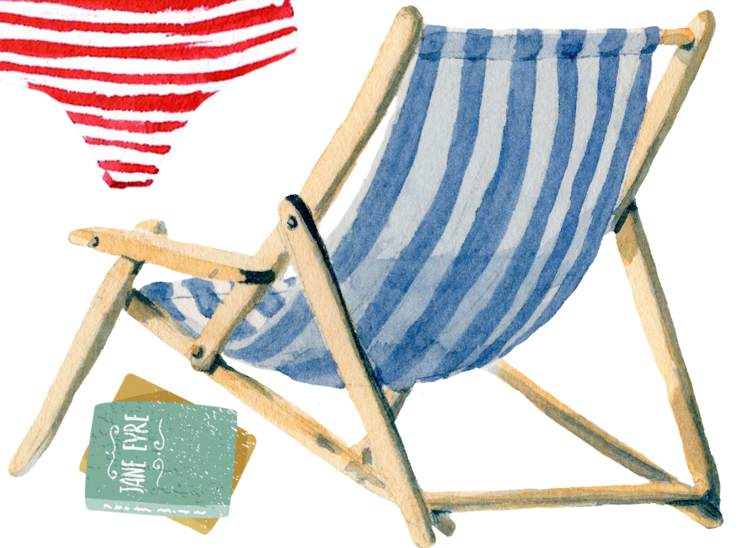
LOUNGE TIME ... WITH LOTS OF BOOKS!