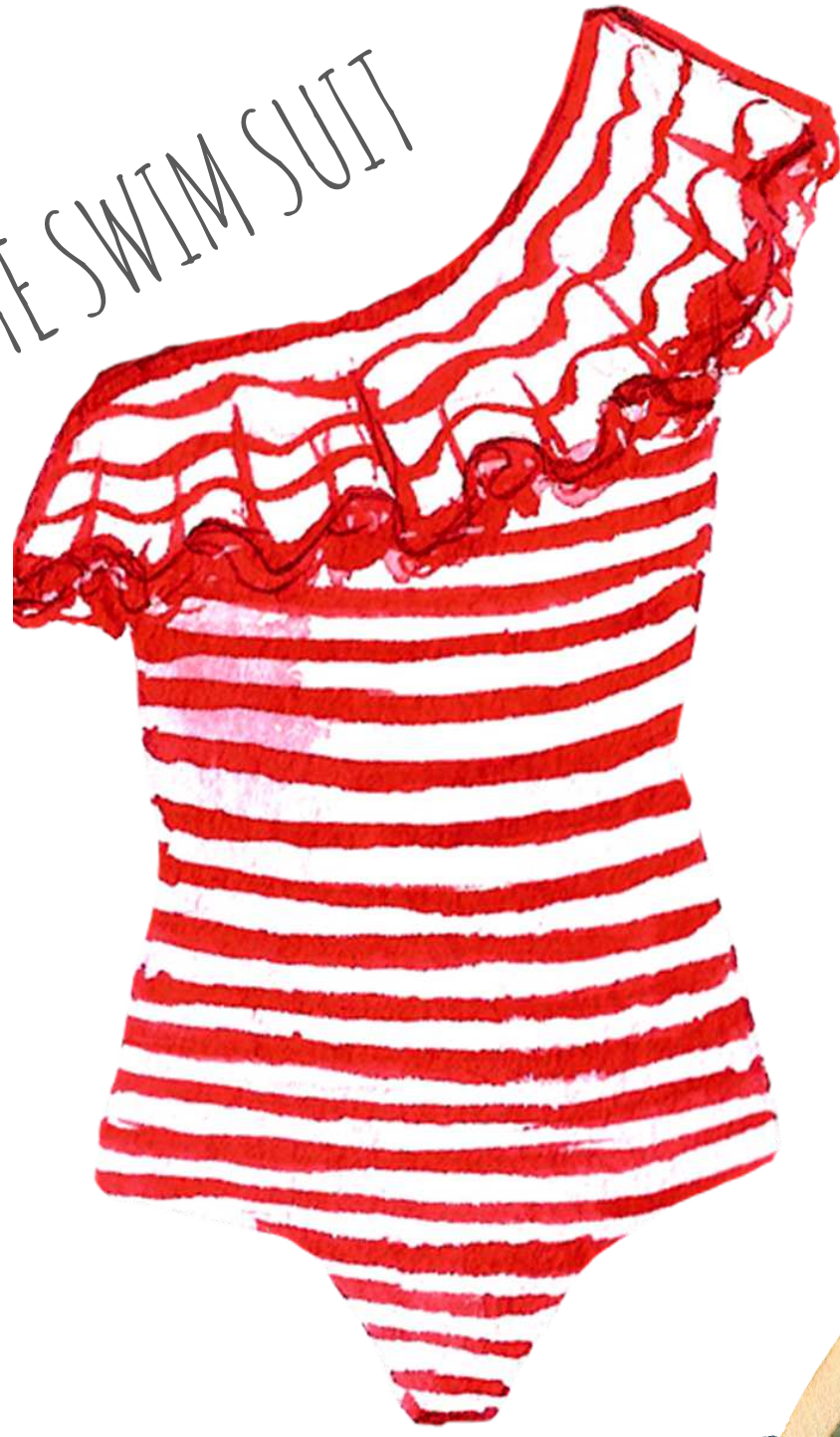
CUTE SWIM SUIT